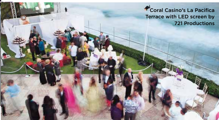
Coral Casino's La Pacifica Terrace with LED screen by 721 Productions